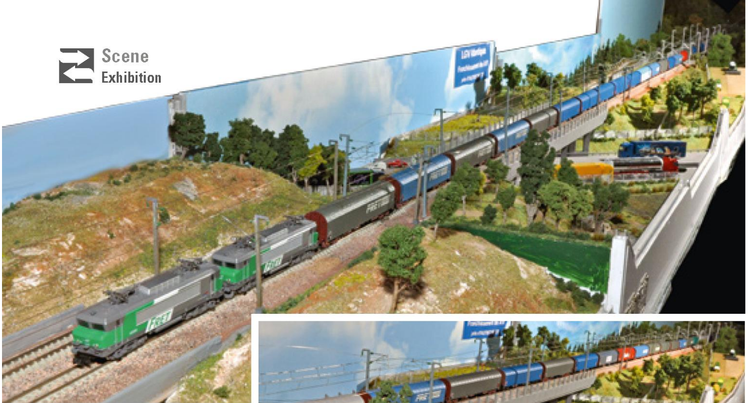
Record train at the Mondial du Modélisme: 104 Minitrix freight cars hauled by two Minitrix FRET-liveried electric locos – the N-gauge railroad club AFAN was loudly cheered with its Long Train Event in Paris.